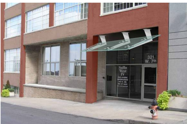
Awning design concept