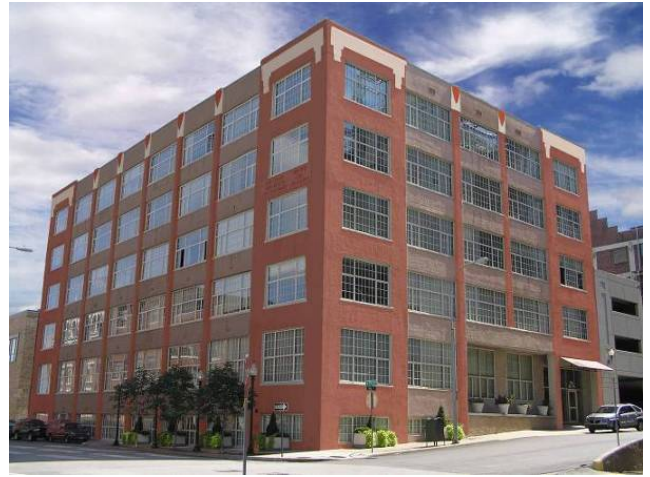
Color study rendering (Selected)